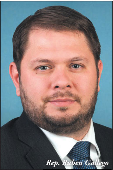
Rep. Ruben Gallego