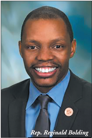
Rep. Reginald Bolding